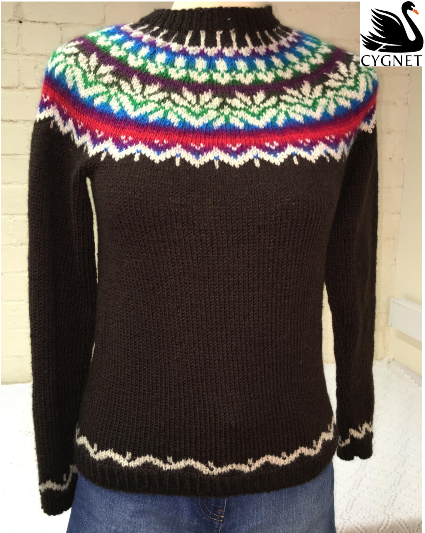
CY1014 Cygnet Boho Spirit Icelandic Sweater and Cardigan and Slouchy Beanie